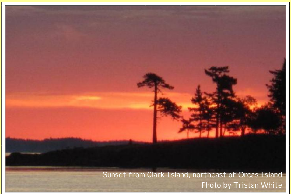
Sunset from Clark Island, northeast of Orcas Island

Also in the upcoming spring issue will be write-ups of our members' winter adventures to places warmer than Colorado.